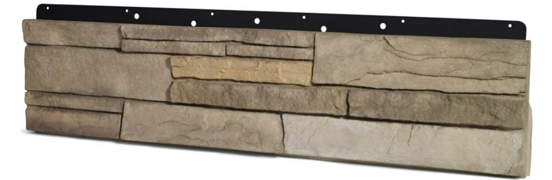
FIGURE 1. VERSETTA STONE® PANEL WITH NAILING HEM (ACROSS TOP OF PANEL)

4.1 The product evaluated in this TER is shown in Figure 1.